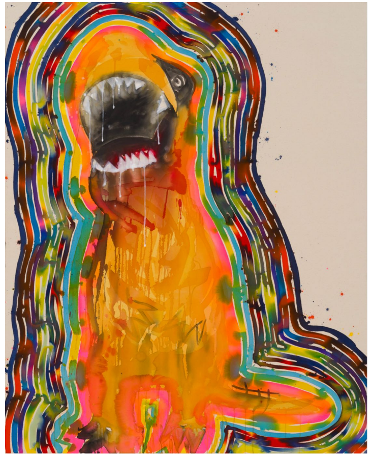
Liz Markus, Alabaster , 2023. Acrylic on canvas, 152.4 x 121.9 cm