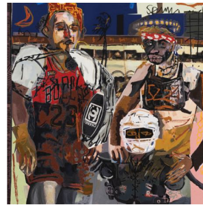
Olivier Souffrant Cinco 2 Trey 2023 Acrylic and archival CMYK ink on canvas 203 x 203 cm