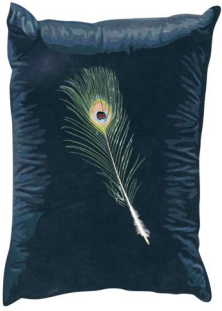
Nick Doyle Lay To Rest 2023 Dyed denim on custom panel 108 x 74.3 cm