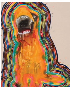
Liz Markus Alabaster 2023 Acrylic on canvas 152.4 x 121.9 cm