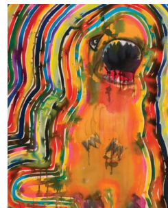
Liz Markus Meteorite 2023 Acrylic on canvas 152.4 x 121.9 cm