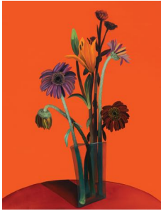
Coady Brown Bouquet #16 2023 Oil on canvas 76.2 x 61 cm