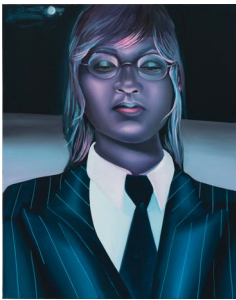
Coady Brown Moonside 2023 Oil on canvas 61 x 50.8 cm