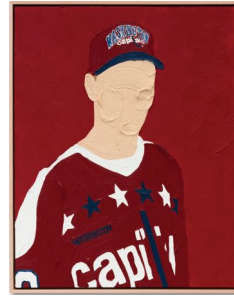
Shaina McCoy Unk Otis 2023 Oil on canvas (framed) 76.2 x 61 cm