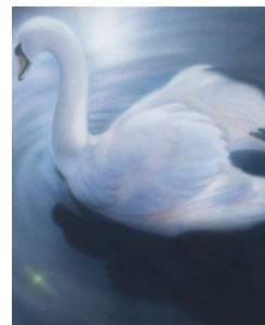
Aryo Toh Djojo Sure 2023 Acrylic on canvas 50.8 x 61 cm