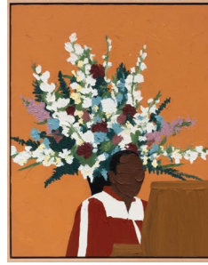
Shaina McCoy Let the Choir Sing 2023 Oil on canvas (framed) 76.2 x 61 cm