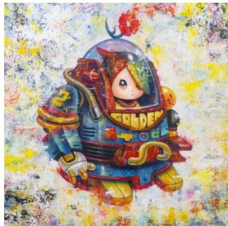
Yosuke Ueno The Proof of the Man 2023 Acrylic on canvas 194 x 194 cm