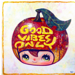
Yosuke Ueno APPLE #5 2023 Acrylic on canvas 194 x 194 cm