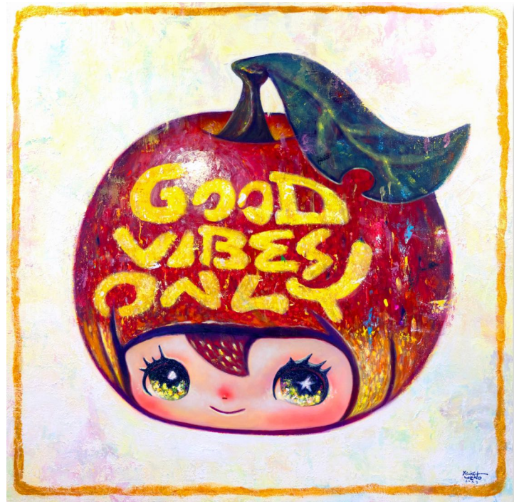
Yosuke Ueno, APPLE #5 , 2023. Acrylic on canvas, 194 X 194 cm

Yosuke Ueno's artistic expression is a celebration of the boundless capabilities of creativity and imagination, resonating with art professionals and enthusiasts alike. His work not only captivates the eye but also invites contemplation and introspection, making him a pivotal figure in contemporary art.