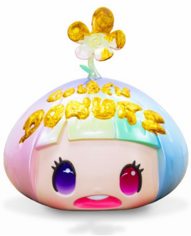
Yosuke Ueno Happy Go Lucky (Golden Donuts) 2023 Polystone with painted embellishments by the artist 25 x 23.5 x 21 cm