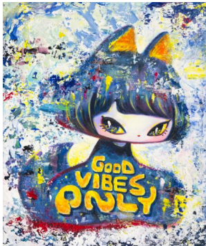
Yosuke Ueno Hello Today 2023 Acrylic on canvas 45.5 x 38 cm