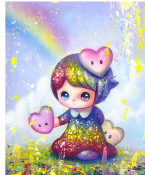
Yosuke Ueno After Rain 2023 Acrylic on canvas 45.5 x 38 cm