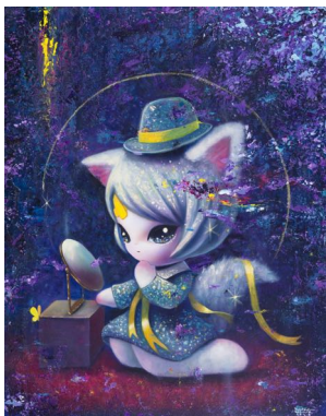
Yosuke Ueno Philosophy's Edge 2023 Acrylic on canvas 116.7 x 91 cm