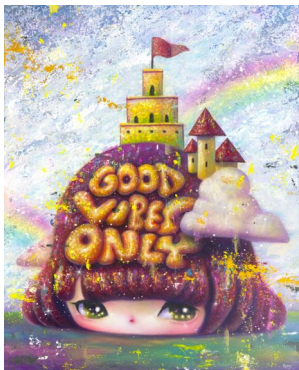
Yosuke Ueno Welcome To My Room 2023 Acrylic on canvas 162 x 130.3 cm