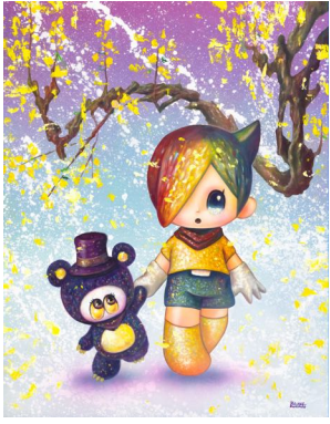
Yosuke Ueno One Thousand Years of Solitude 2023 Acrylic on canvas 116.7 x 91 cm