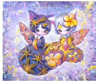
Yosuke Ueno ONE 2023 Acrylic on canvas 162 x 194 cm