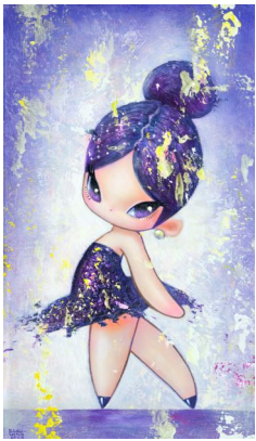
Yosuke Ueno New Shoes 2023 Acrylic on canvas 72.2 x 41.7 cm