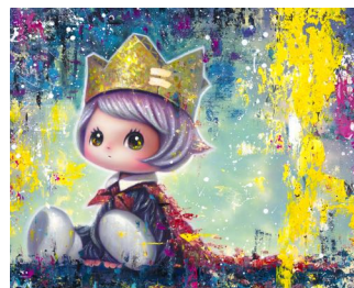
Yosuke Ueno Thunderbolt Blues 2023 Acrylic on canvas 80.3 x 100 cm