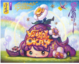
Yosuke Ueno You Are Okay 2023 Acrylic on canvas 181.8 x 227.3 cm