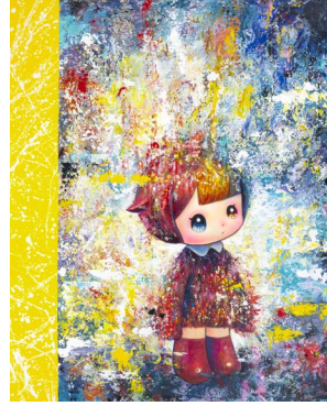
Yosuke Ueno Prelude III 2023 Acrylic on canvas 162 x 130.3 cm